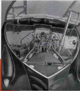
Note the crash board beneath the dash, the padding of the top, and the hinged section of the roof to make it easier to get in and out. Above, view of power plant

is formed of molded rubber to eliminate vibration and road shock. Powered by an airplane-type engine, this car of the future can reach a peak speed of 115 miles an hour.