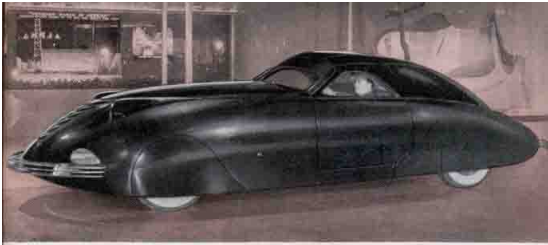
With an airplane-type motor and front-wheel drive, this fully streamline car makes 115 miles an hour