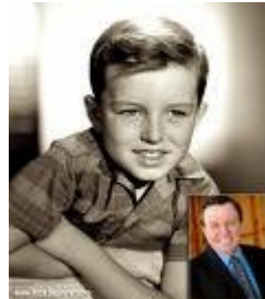
And Jerry Mathers As The Beaver