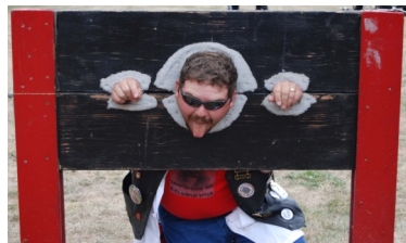
Crash in Stocks

I am writing a piece because, well I ran out of stuff to barrow and I needed to fill some space, so lets see how I do. At our last meetn we really could have used a better showing of red shirts, I know that a lot of people work at that time or are sick but it would be nice to have